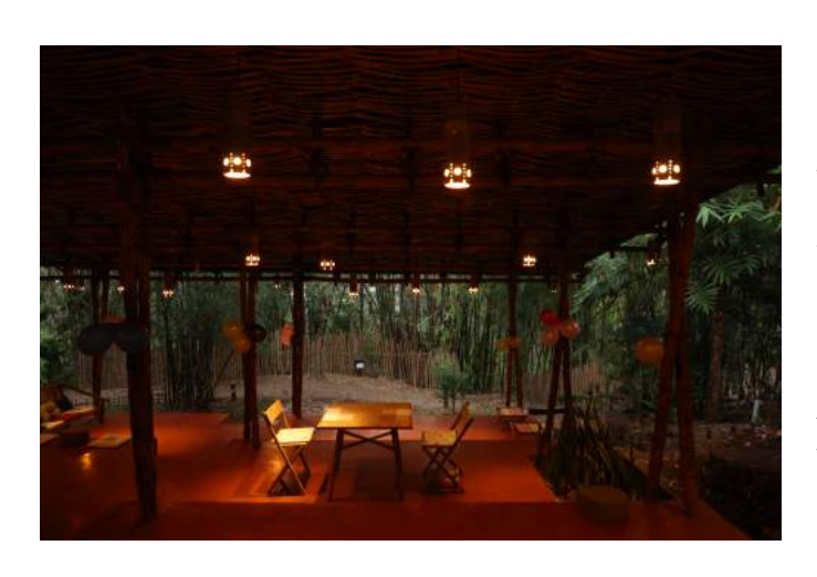
08 February, Saturday: Yoga, Artists studio visit, Lunch at farmers' house, Ayurveda, Bonfire, Goodbye dinner

Yoga asanas in the morning. After breakfast, we visit the local artists studios. Lunch will be at the farmers house. Ayurveda treatment. In the evening there will be a bonfire and a Wayanad good-bye dinner.