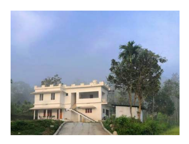
(Photo: Ayurveda Center at a 10 mins walking distance from Uravu Bamboo Groove)