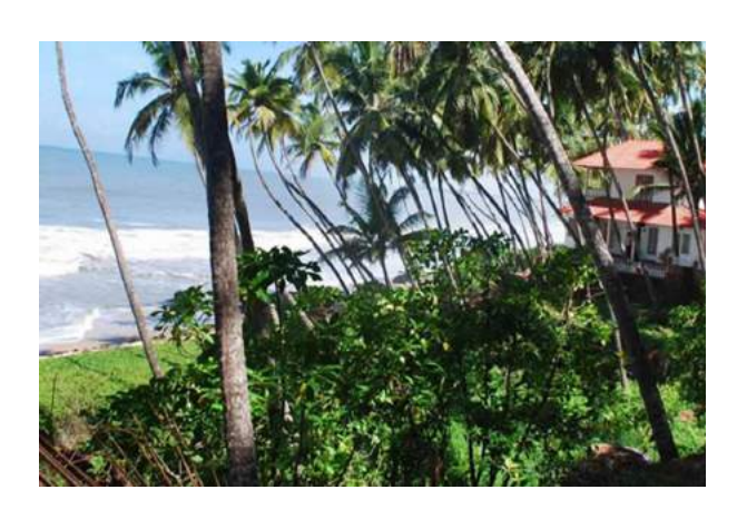
09 February, Sunday: Yoga, Departure to Kannur & check in at Sea-Shell Resort

Yoga asana practice in the morning. After breakfast we depart to Kannur and check in at the beautiful beach side Sea-Shell resort.